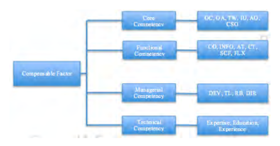
Figure 4 Telkom Foundation's Compensable Factor

The four competencies consists of sub factors or sub competencies that taken from Spencer Dictionary. Core competency was taken from Telkom Foundation's core values namely Integrity, Harmony, and Excellent as stated in previous chapter. Then the rest of sub competencies distributed to the Functional, Managerial, and Technical Competency. Based on the discussion and analysis, figure 4 shows the content on each Compensable Factor which refer to Spencer Competencies Dictionary.