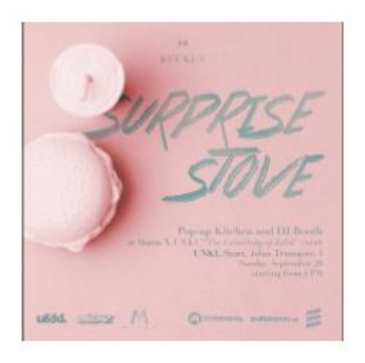
Figure 1. Surprise Stove

Flyer, X-banner followed by poster have usually been the promotional kits of the event, festival even some of the cigarette companies exerts this term to 'decorate' the appearance of street stall standing on the sidewalk, conversely, Keuken has dissented with those common way of promotion. Utilizing social media through the Internet, which is now easily accessed not only through the personal computer, but also what we have already known, the smartphone. With the users of smartphone in Indonesia had nearly reached 15 million users in 2013[2], the organizer realized that need to find new way to widen the event information utilizing the social media a tool of promotion. By way of connecting cyberspace and real space, they used pre-event of festival and spread the information in their social media kit, gaining awareness and attention from the visitors.