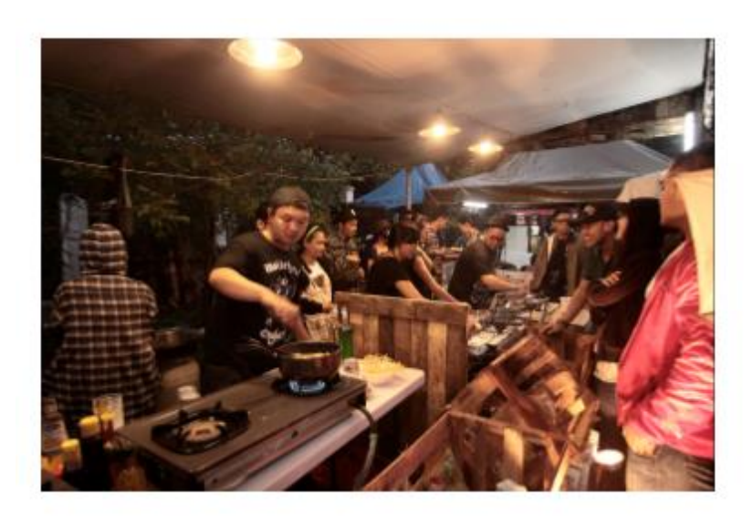
Figure 2. Kitchen Stage

The organizer successfully invited nearly 60 chefs since the first Keuken. Almost all of them have strong influence to their communities, such as fashion designers, musicians, or politicians. Usually the guest chefs will be invited couple months before the day of the festival to have several briefs from the organizer, being interviewed for the Keuken's blog or other social media. In fact, they also actively support to spread the promotion through their own social media accounts. There were no particular difficulties inviting the guest chefs, just utilizing friend network within the committee, eventually lot of invitees were gathered. Some people carried out cooking performance by pro bono; it means they did not need amount of fee, not as if they perform for the music concert or acting in front of camera for TV drama. The reasons why they did this performance was a collaboration spirit with the event to deploy the message behind, or this was also first experience to perform as chef towards the public, and they just supported their friends who invited them to cook.